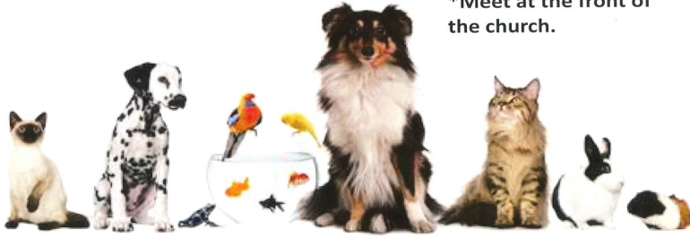
St. Clement's Episcopal Church / 3600 Harper Rd. Clemmons

Saturday, October 12 @ 11:00 am *Meet at the front of the church.